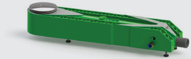
Zypho iZi Product

The Zypho is Watermark Certified and fully compatible with the complete Stormtech product range and, as Zypho's exclusive Australian partner, Stormtech can assist with integration requirements, site specific needs and installation suitability.